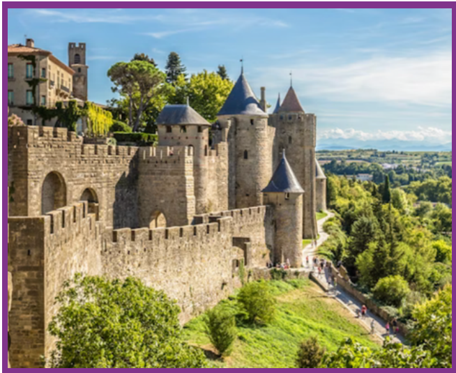
Cité de Carcassonne (5)

Take the opportunity to discover Toulouse and its surroundings, such as the city of space, the basin of Saint-Ferréol (4 km from Revel), the city of Carcassonne, or Albi.