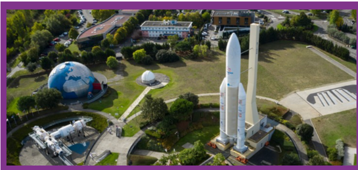
Cité de l'Espace (3)